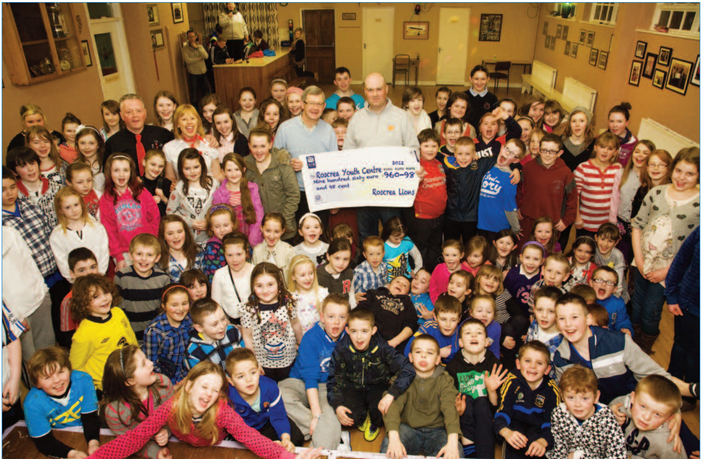
2012 Lions Walk fund raisers, the Roscrea Youth Centre Members of the Youth Centre who raised €960.98 for the Club in the Lions Charity Walk.