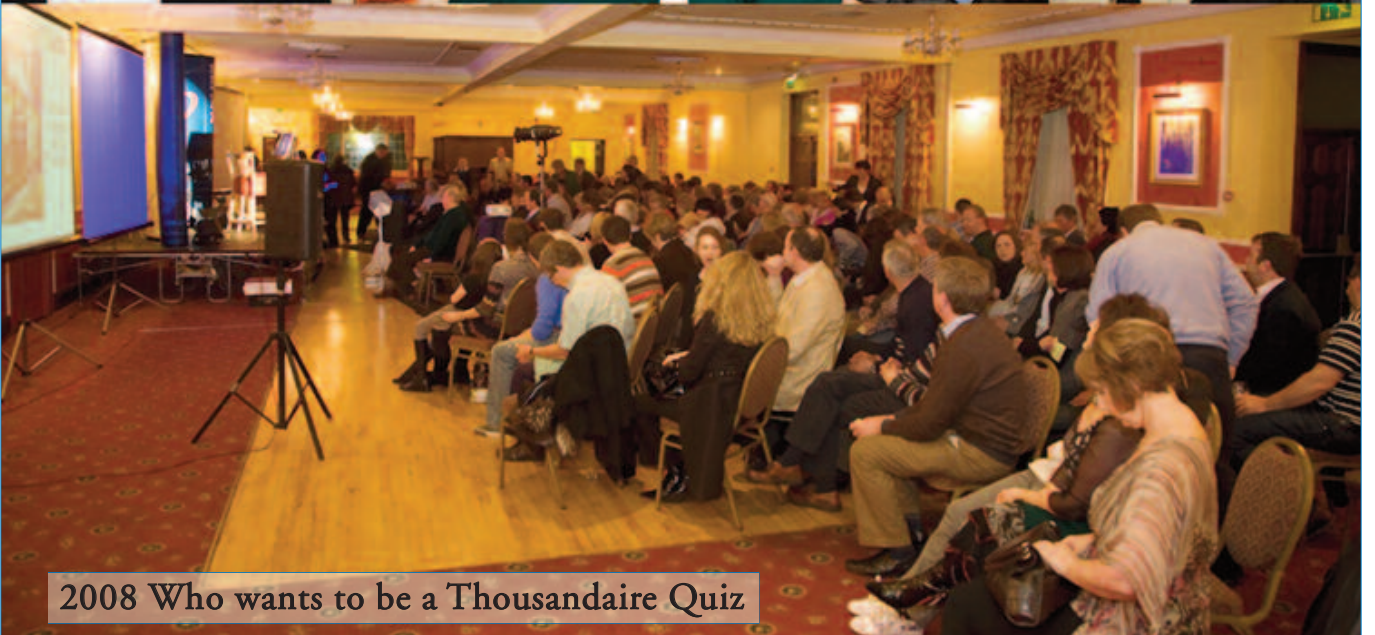
2008 Who wants to be a Thousandaire Quiz