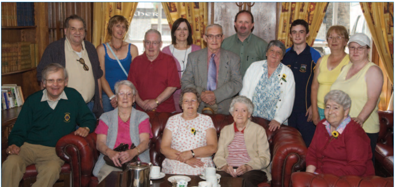
2007 Trip to Trabolgan