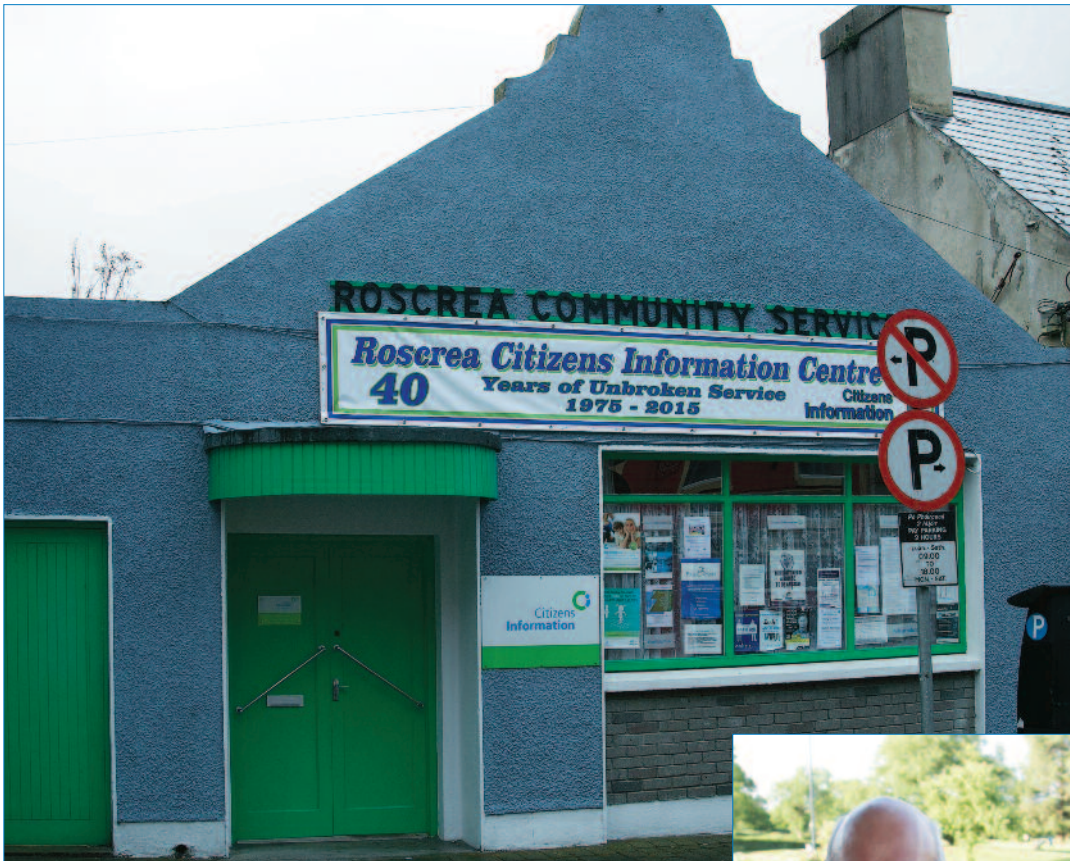
Community Hall Rosemary Street Headquarters of Lions Club of Roscrea