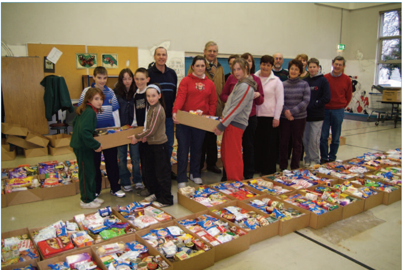
Lions Christmas Hampers with young volunteers helping with the packing