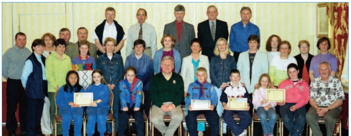
Presentation to Roscrea Scouts and Sacred Heart Primary School