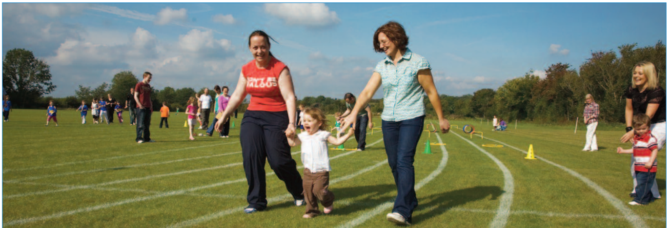
Lions Family Day at Villa Park – Fun for all the Family