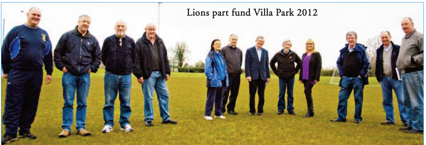
Lions part fund Villa Park 2012