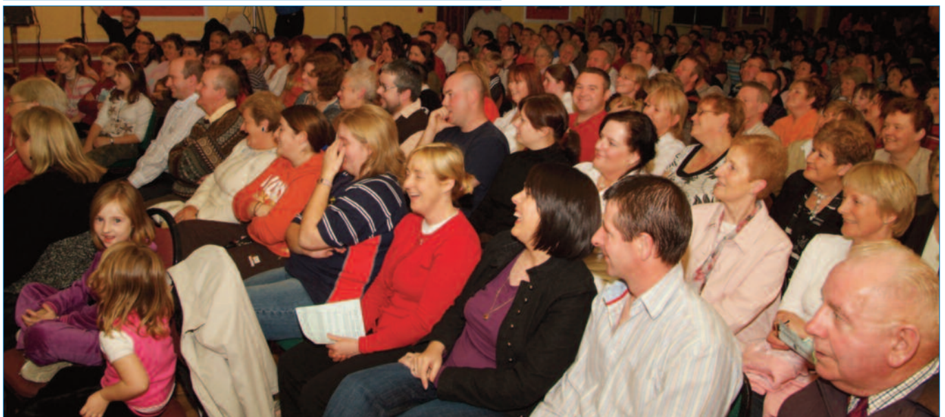
The picture says it all. A capacity audience thoroughly enjoying themselves at Roscrea Lions Club 'Stars in their Eyes'.