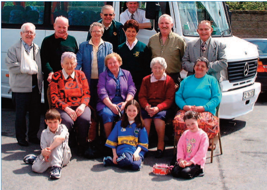
Lions trip to Trabolgan Group of holiday makers ready to go to Trabolgan.