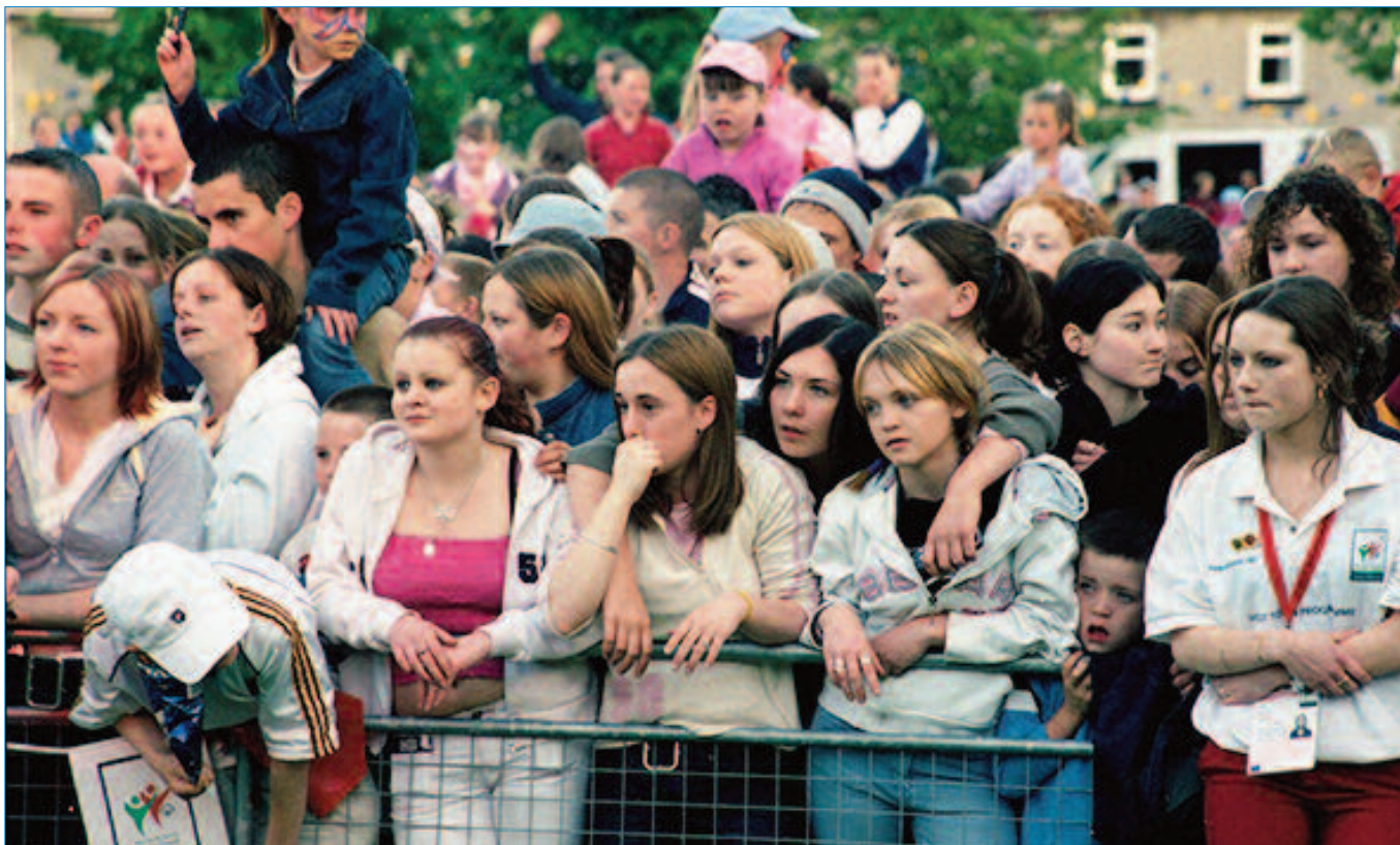
Lark in the Park