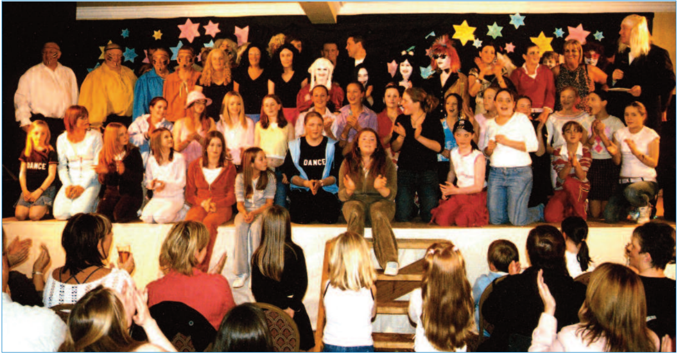
2004 Stars in their Eyes - cast The large cast of local people on stage.