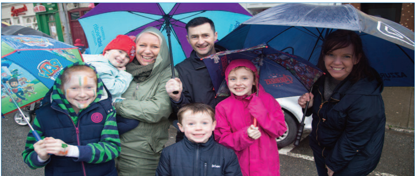
The O'Sullivan and O'Toole families in good mood despite the rain watch the Lions Club Float promoting the Rosemary Project Caring for Carers.