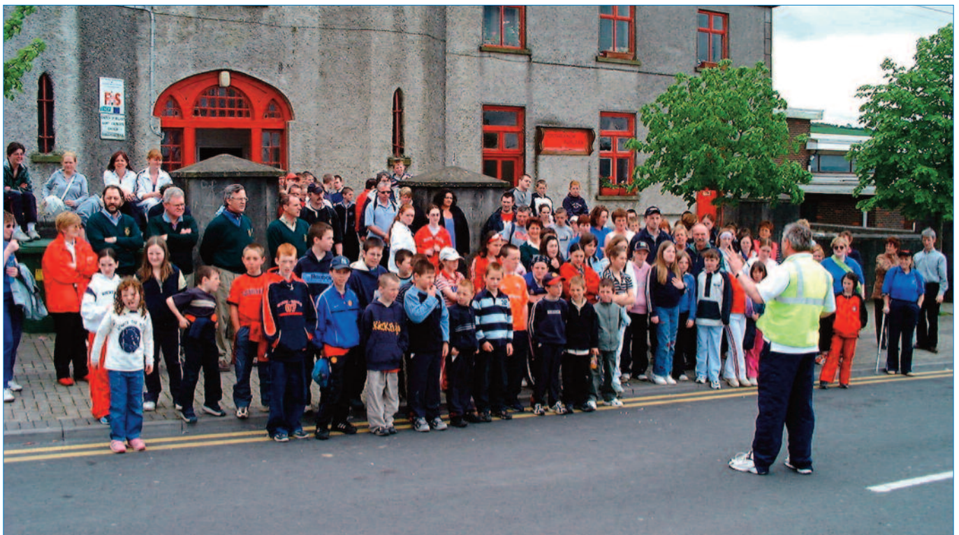
Annual Charity Walk Ready for the off at Temperance Hall.